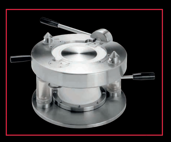
An active valve can be transformed into a passive valve, or an automatic active valve can be converted into a manual valve simply byeliminating or replacing a few parts. That means: a minor refit resulting in shorter downtimes without additional spare parts.