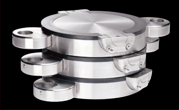
More convenience in practice

The ASBV docking system is much easier and more convenient to operate, the positioning of the passive valve on to the active valve is 180° turnable.