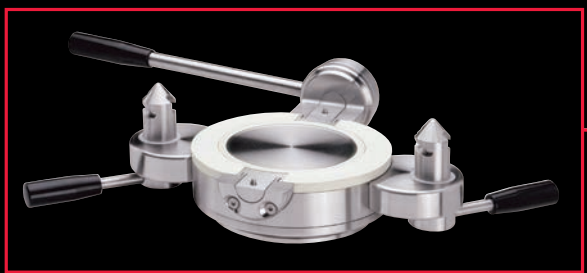
Sophisticated in every detail Automation is not always needed. Sometimes, less is more. Manual valves are easy to operate and do not need controls.